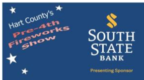
TITLE SPONSOR- Pre-Fourth Fireworks